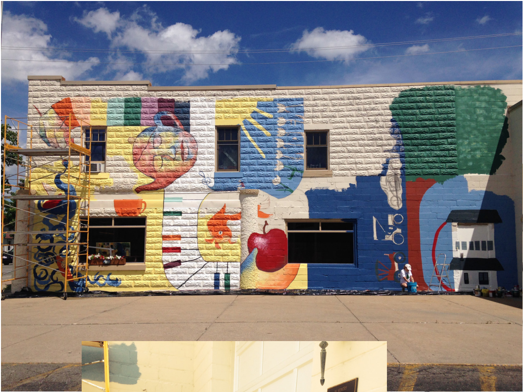
...And paint some more.