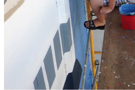
...And teach them how to slack off and eat pizza.