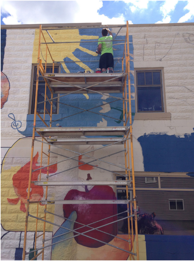
...And recuite tall kids to paint the high places.