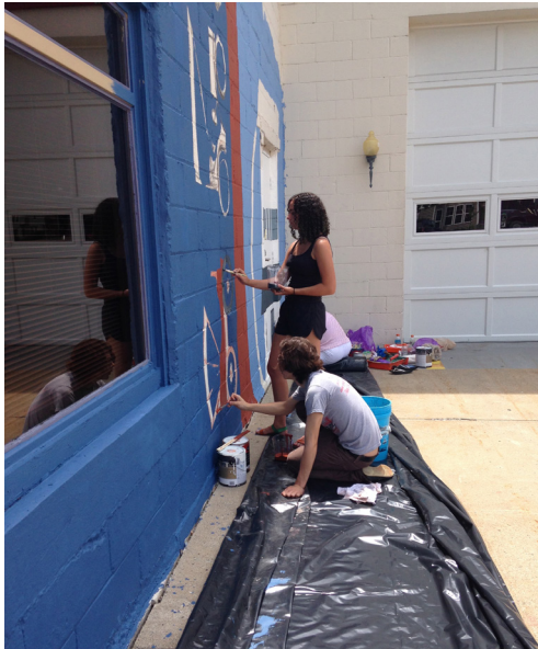
...And flexible kids to paint the low places.