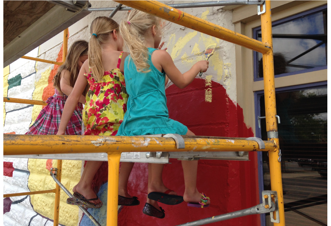
...And spunky kids to paint on top of stuff.