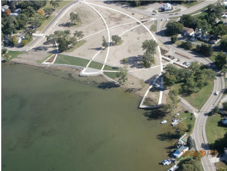
Curved pathway pattern