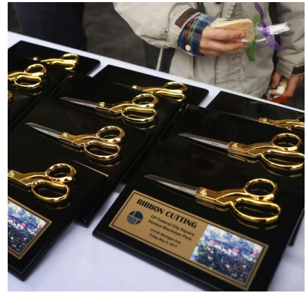
May 2017: Ribbon Cutting!