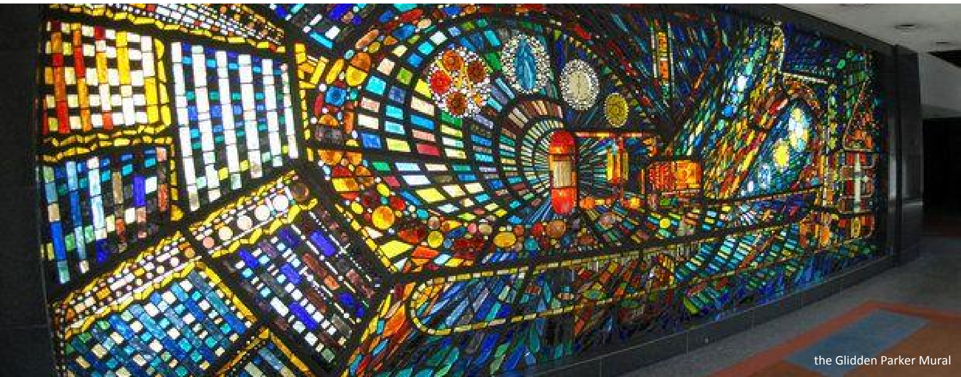
the Glidden Parker Mural

Jackson's City Square Project: a creative placemaking endeavor